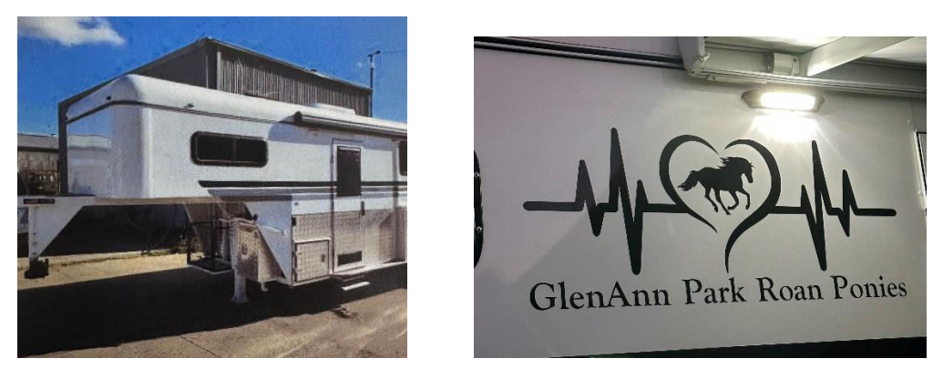
If you see us please come and introduce yourself.

In October 2022 we tracked to Sydney for the Roan Nationals it was a long and rough trip with a truck and 4 horse float and came home and ordered a gooseneck.